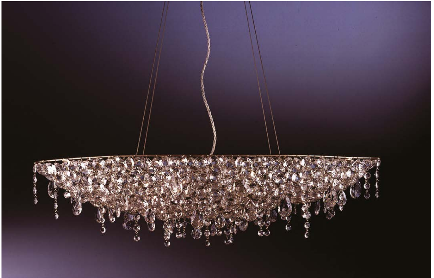
in the picture Ugolino elliptic 80